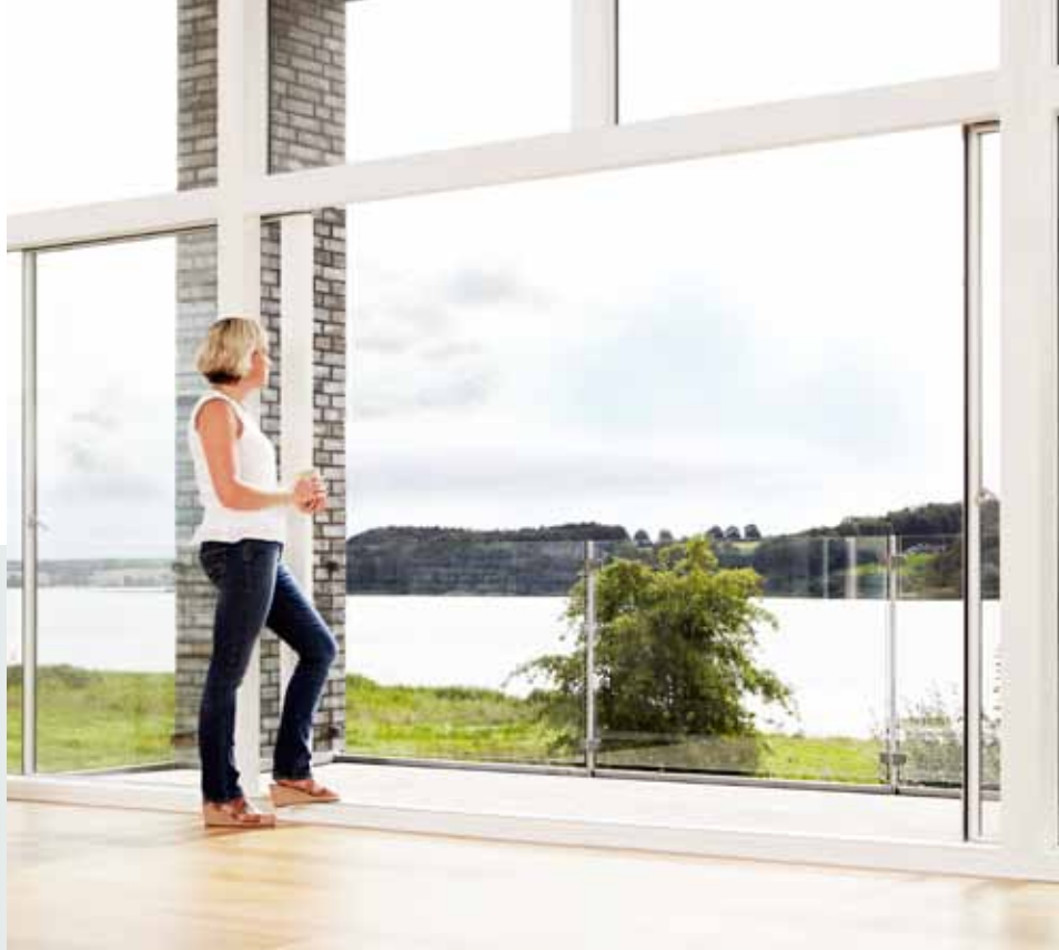
SLIM FRAME | GOOD ENERGY